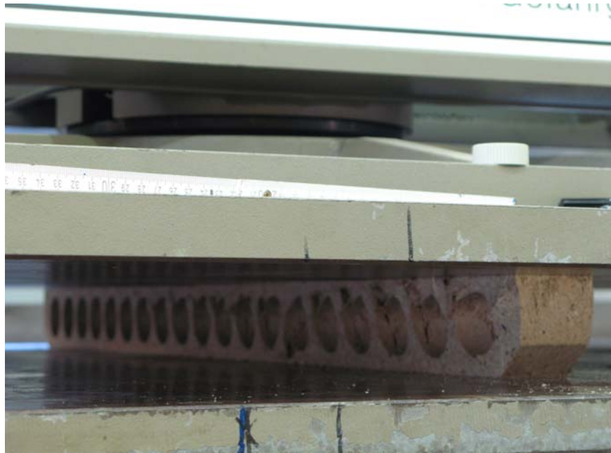
Fig. 3: Bearer under a breaking load of over 13,000 daN (cf. Real load in the stack approx. 2,500 daN max.)