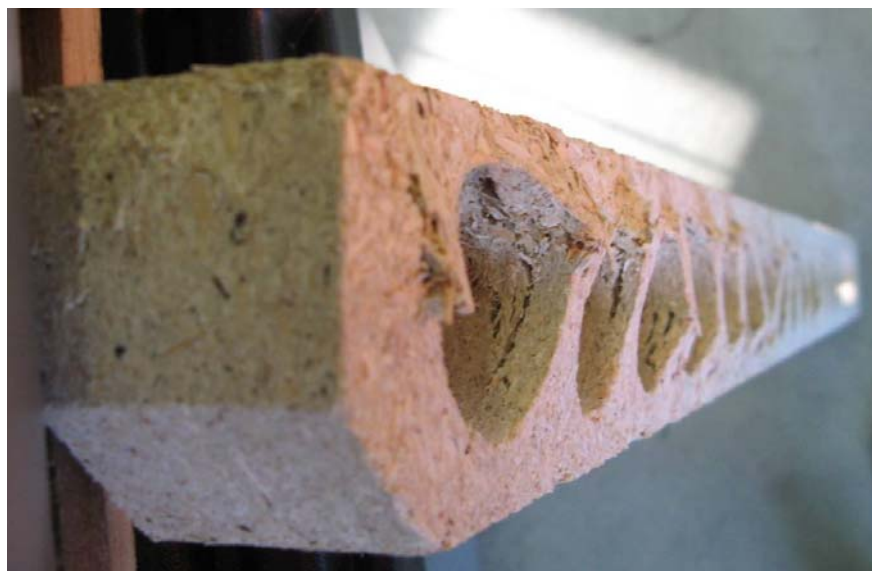
Fig. 4: Deformed bearer after the compression test with a breaking load of over 13,000 daN (cf. Real load in the stack approx. 2,500 daN max.)