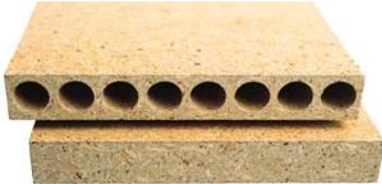
Fig. 1: Tubular and solid chipboards

These boards have a low grammage in line with a high pressure resistance.